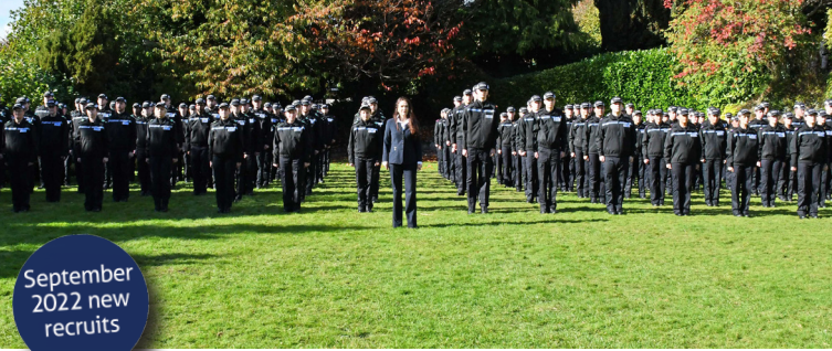
September 2022 new recruits