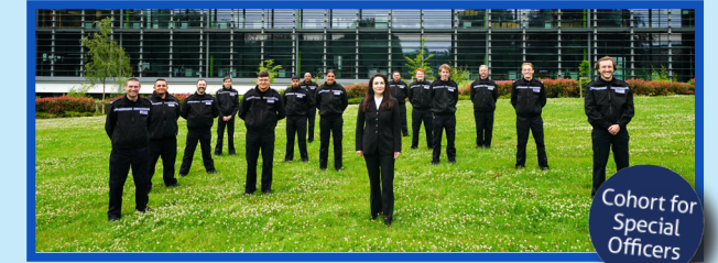
Cohort for Special Officers