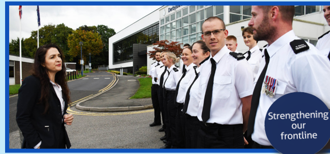
Strengthening our frontline