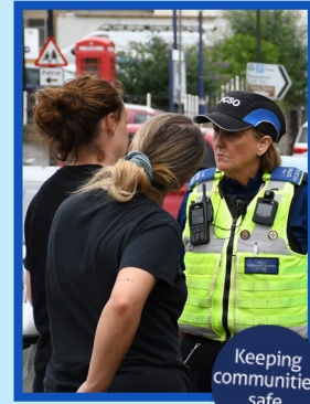
Keeping communities safe