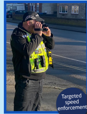
Targeted speed enforcement