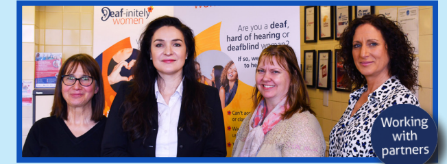
Working with partners