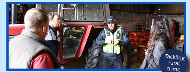
Tackling rural crime