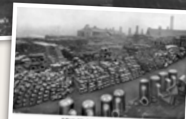
Examples of odd-stuff in the foreground