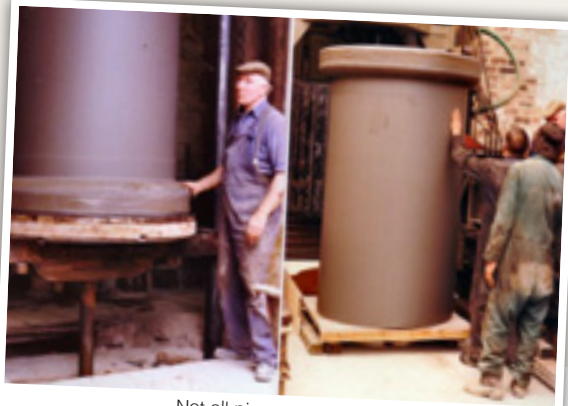
Not all pipes were small!!

During the life of the business the company had three locomotive steam engines, named 'Thomas Wragg' to take the finished goods along the sidings to the Swadlincote loop railway line. They were kept in a shed just below where you are.