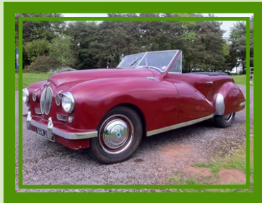
Paramount Car