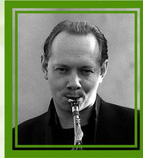
Joe Jackson performing in Arizona, July 1982