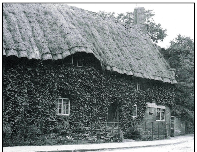
The old Post Office

Women in the village who had time on their hands saw it as their duty to serve others - knitting and sewing for the war effort. No woman should be just sitting, she should be knitting. Even Queen Mary sat knitting. Cardigans, socks, sweaters, mittens, scarves and anything else that could be knitted was produced in enormous amounts. Sewing focussed on clothing for the troops and the sick and wounded in hospitals. In addition women organised fund raising bazaars and fêtes in the summer. Money being sent to the Red Cross. What the war brought was recognition that women were wanted and no longer helpful but essential. Even if they were not wanted on the front line there were increasing opportunities on the Home Front. Nursing, munition work, driving ambulances and working on the land amongst other tasks.